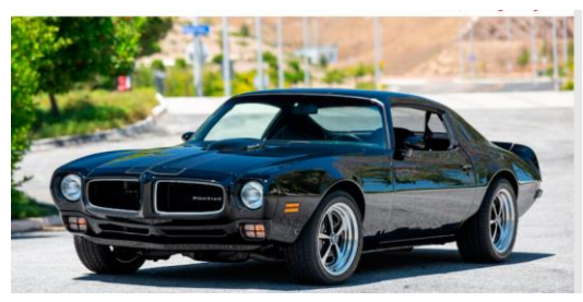
'74 Pontiac Firebird, 400/auto High bid: $20,000