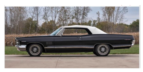
'65 Pontiac Catalina Convertible 421 CI, Factory Air. High bid: $50,000