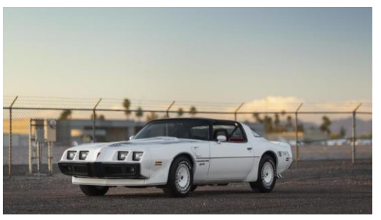
1981 Pontiac Trans Am Recaro/NASCAR 37,000 miles. Sold @ $35,750